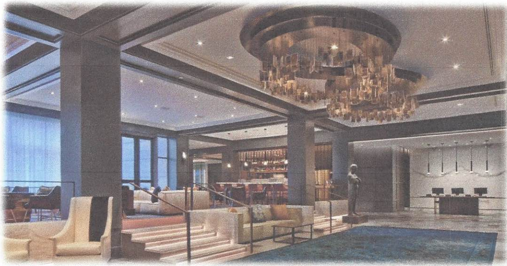
(4 Star) The Logan Philadelphia – Avg. $198/night