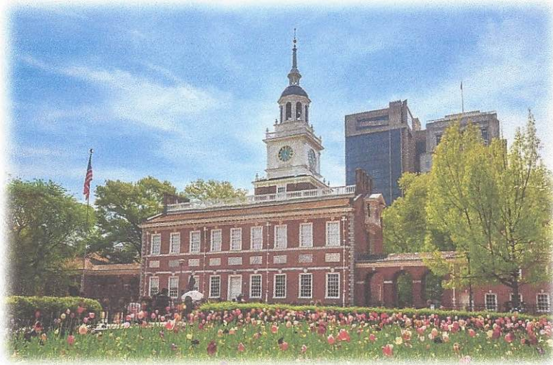
Independence Hall, (erected 1753)

Freedom Watch's Third Continental Congress, taking place on July 5 and 6, 2021, exactly 245 years after our Founding Fathers and the colonies declared our independence for the first time, will be held in the Visitors Center across from Independence Hall in the birthplace of liberty, Philadelphia, Pennsylvania. It was the Second Continental Congress which gave rise to our Declaration of Independence on or about July 4, 1776.