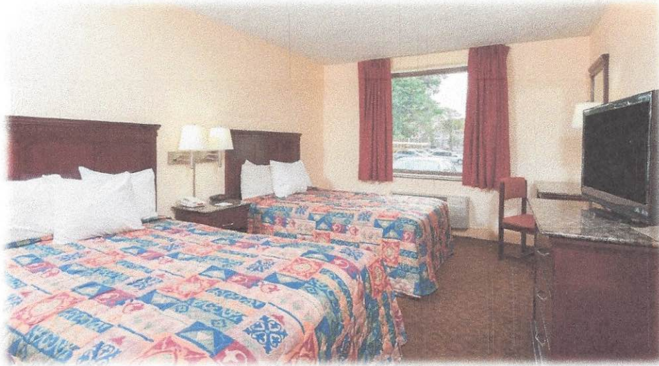
(2 Star) Days Inn by Wyndham Philadelphia – Roosevelt Boulevard – Avg. $86/night

Crafted below for our fellow patriots is a list of approachable hotels within 10 miles of Independence Hall; some within walking distance.