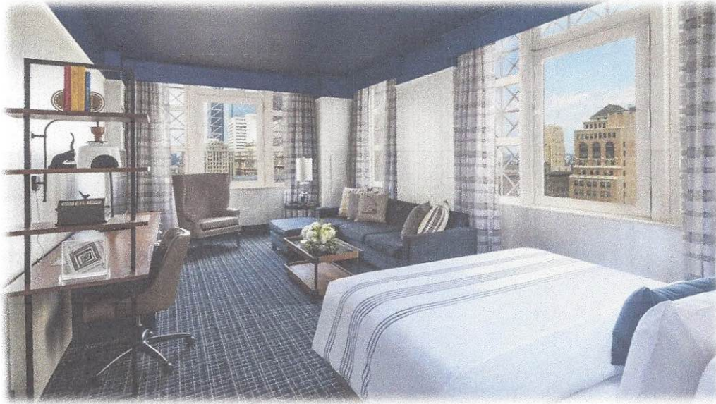
(3 Star) The Notory Hotel Philadelphia – Avg. $187/night