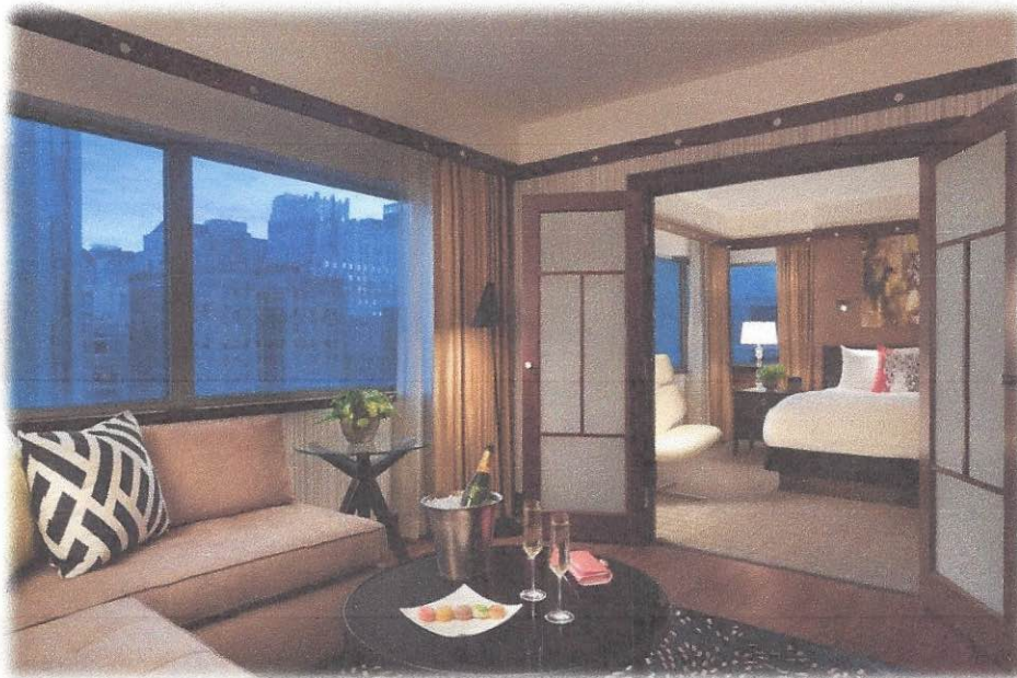
(4 Star) Sofitel Philadelphia at Rittenhouse Square – Avg. $168/night