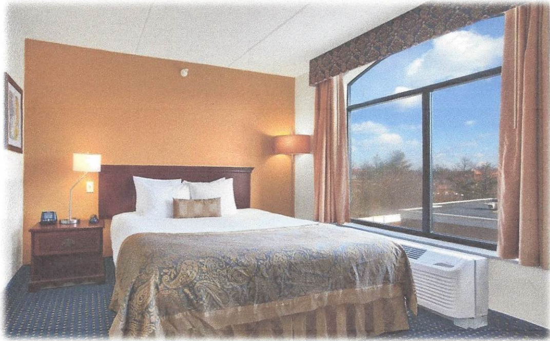
(2Star) Wingate by Wyndham Voorhees Mt. Laurel - $97/night