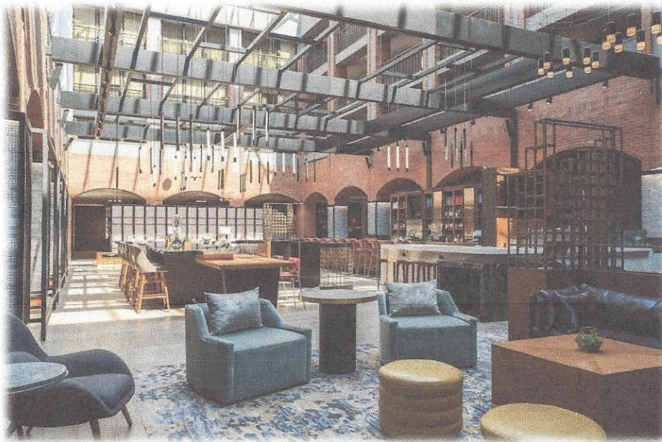
(4 Star) Philadelphia Marriott Old City Avg. $162/night