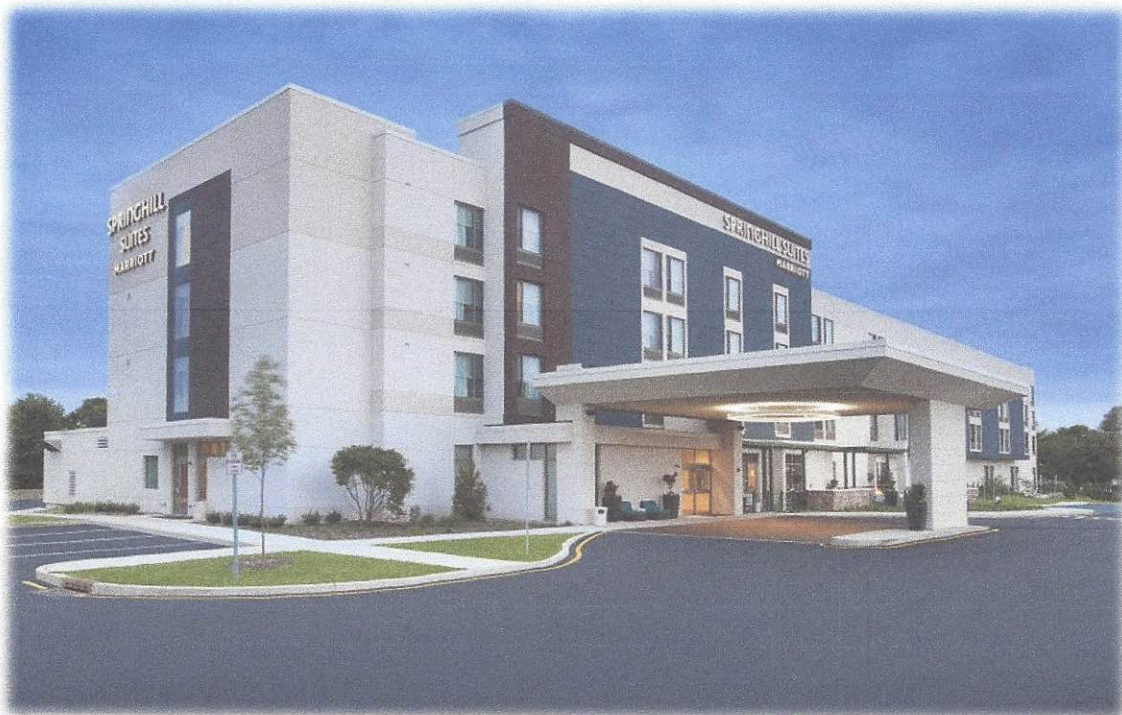
(3 Star) Spring Hills Suites Cherry Hill, NJ – Avg $98/night