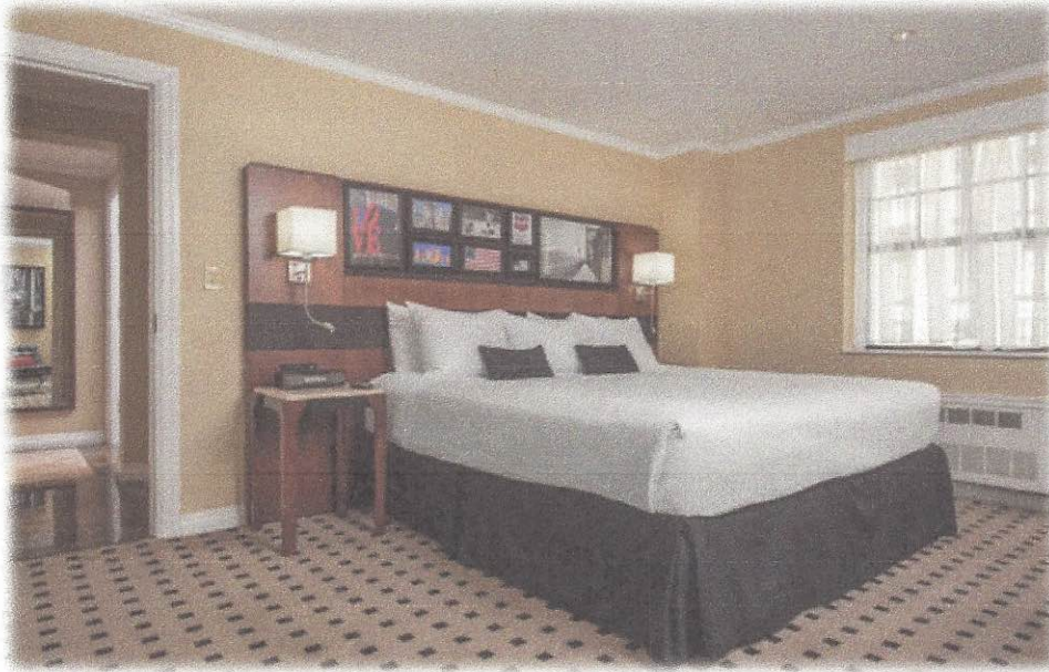
(4 Star) The Warwick Rittenhouse Square – Avg. $162/night