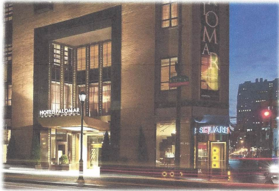
(4 Star) The Kimpton Hotel Palomar Philadelphia – Avg. $178/night