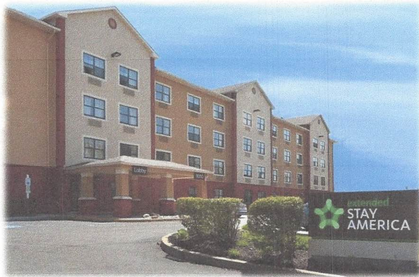
(2 Star) Extended Stay America Philadelphia - Avg. $95/night