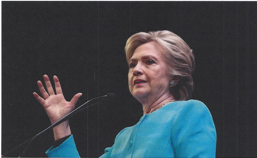
U.S. Democratic presidential nominee Hillary Clinton speaks at a fundraiser in Seattle, Washington, U.S., October 14, 2016.