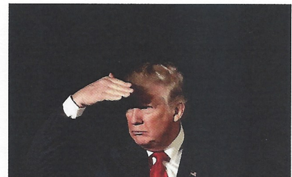
LIVE: Election 2016